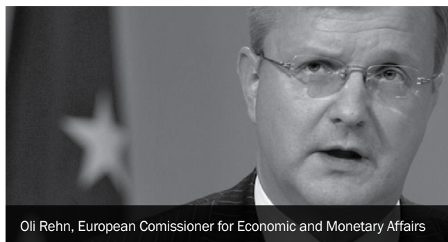
Oli Rehn, European Commissioner for Economic and Monetary Affairs

In late April, the Spanish government unveiled a new four-year stability and reform plan. A few days later, the European Commission extended Spain’s deadline for reducing its public deficit to 3% of GDP from 2014 to 2016. On announcing this two-year extension, Oli Rehn, the European Commissioner for Economic and Monetary Affairs, explicitly recognised Spain’s deficit-reduction efforts and structural reforms. The extension was justified on the grounds that the bursting of the real-estate bubble had created special difficulties in the Spanish economy.