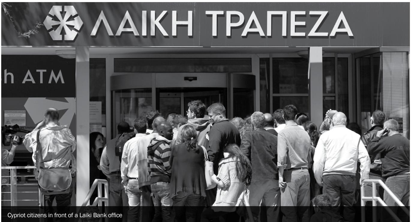
Cypriot citizens in front of a Laiki Bank office

The Cypriot banking sector was unique in several ways: it was vastly oversized, it was heavily exposed to Greek debt, and it had many clients from outside the eurozone, in particular